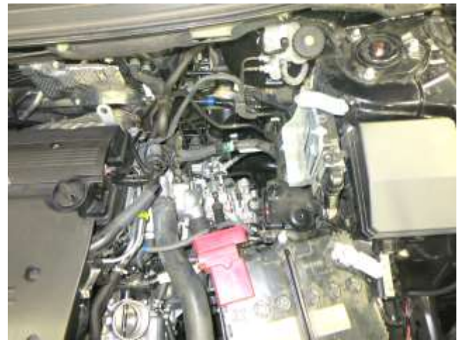
h. Remove the factory intake from the vehicle. Note: Do not discard any of your stock equipment.