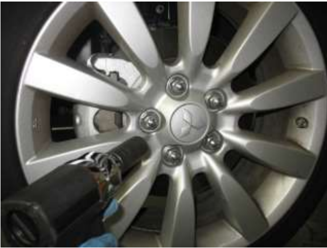
k. Remove the front drivers side wheel with a 21mm socket. This will be re-installed in step 3n.