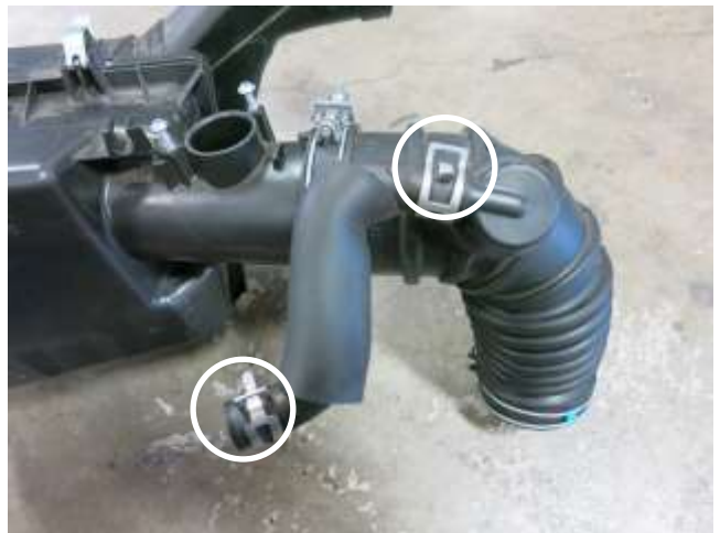
n. Remove the two springs clamps circled. These will be reused in step 3m.