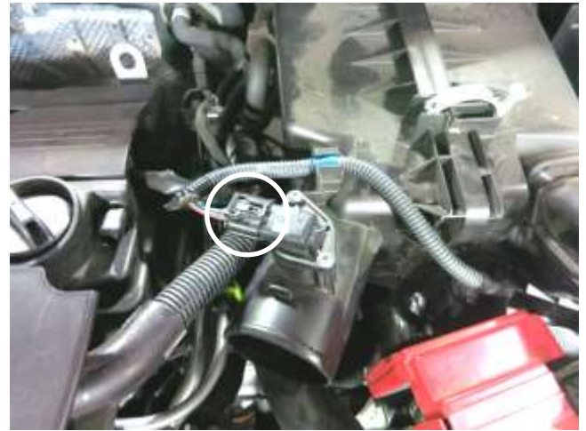
f. Unplug the electrical connector from the mass air sensor.