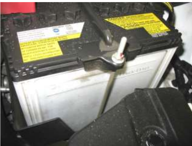
i. Remove the factory J-hook on the front side of the battery tie down. Push the battery toward the back of the vehicle. The nut will be re-used in step 3a.