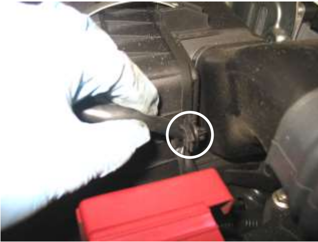
e. Detach the MAF sensor wiring clip from air box.