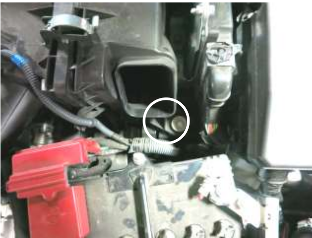
g. Remove the bolt that holds the factory air box in the engine compartment.