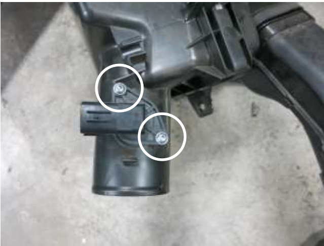
m. Remove the MAF sensor with the supplied T20 L-Key. This will be re-used in step 3d.