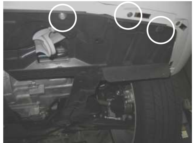
j. Raise the front of the vehicle with a jack. Refer to your owner's manual for proper jack and jack stand placement to properly support vehicle. Support your vehicle using properly rated jack stands before wheel removal or while working under the vehicle. NEVER WORK UNDER A VEHICLE WITHOUT USING JACK STANDS. Remove the plastic trim underneath the front of the vehicle on the driver side.