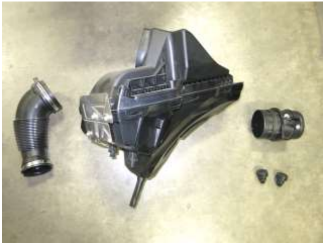
h. Use the Torx tool to separate the MAF sensor housing from the factory airbox. If the rubber feet shown in the lower right in the picture above came out of the vehicle with the airbox, put them back in their holes in the chassis rail.