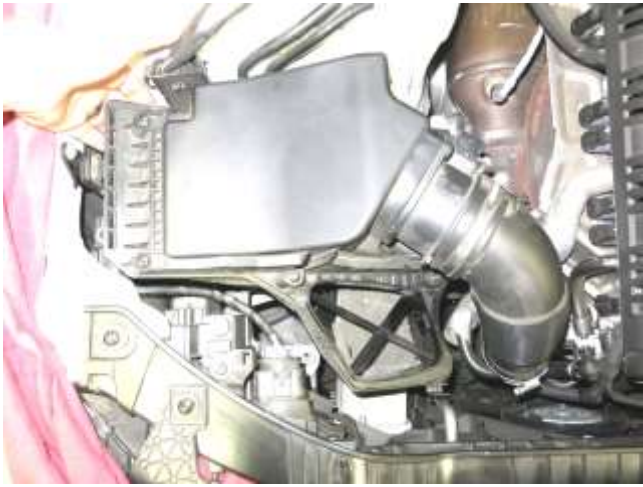
f. Lifting from the turbo end of the duct and the opposite corner, remove the factory airbox assembly.