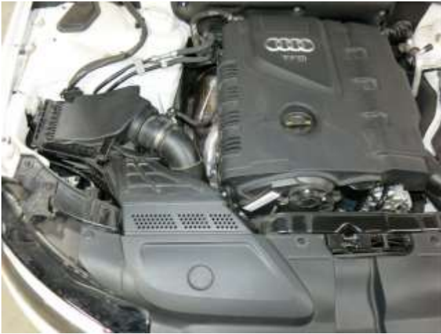
e. Factory air induction system.