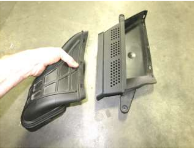
i. Disassemble the dirty air duct assembly by squeezing as shown.