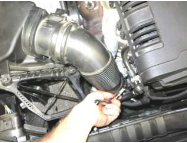
e. Disconnect MAF sensor and loosen the clamp securing the factory clean-air duct to the turbocharger.