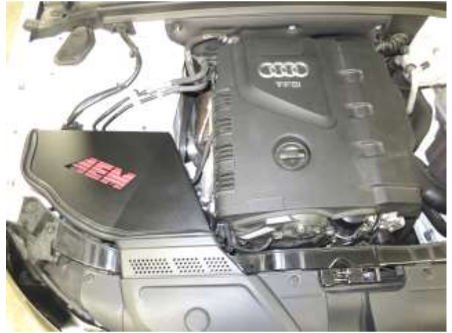
f. Finished installation of AEM Intake System.