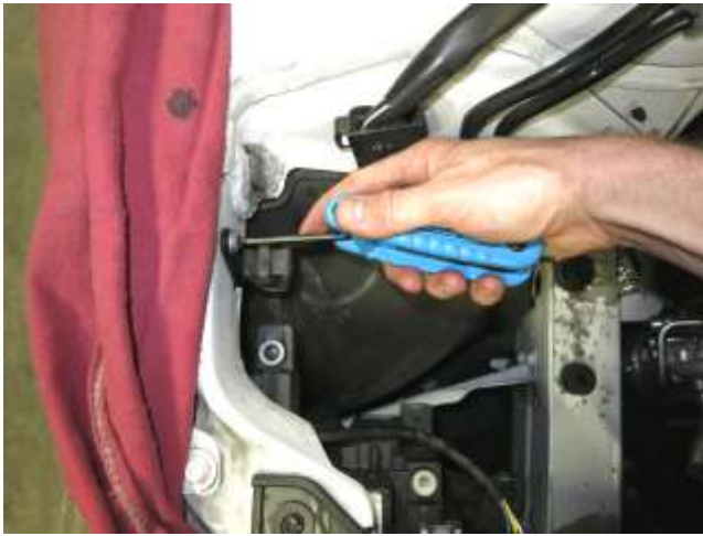
g. Use the Torx tool to remove the factory airbox mount bracket. The bolt will be re-used.