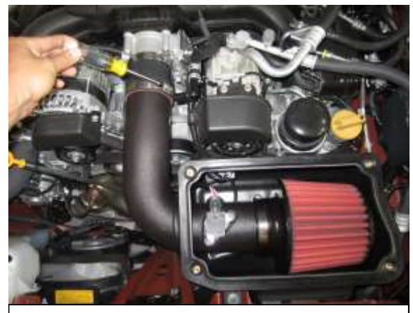
I. Rotate intake tube to line up with throttle body and slide coupler over throttle body. Ensure adequate clearance around cone filter and adjust tube position accordingly prior to tightening hose clamps on coupler. Connect ETI module plug to MAF sensor.