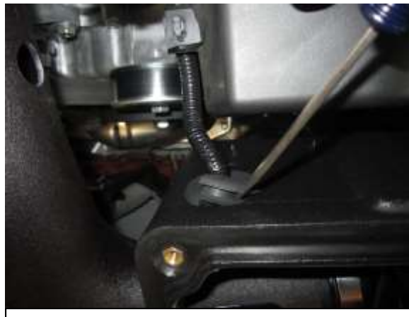
k. Insert MAF wire harness into slit grommet(M) provided and carefully install into rear side of airbox using flathead screwdriver. Relieve any excessive tension at MAF plug with additional wire slack inside airbox.