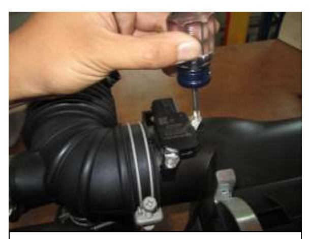
g. Remove 2 screws on intake box to remove MAF sensor and set aside for installation on AEM intake tube.