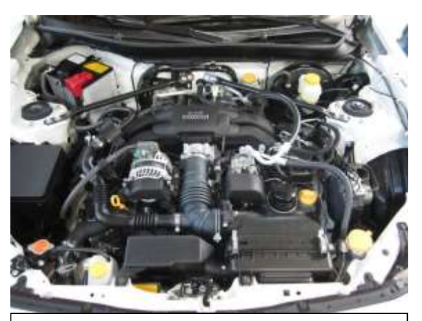
a. Stock intake system