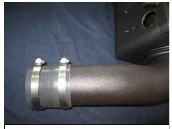
f. Use mild soap/water solution to slide coupler(E) over other end of intake tube along with 2 hose clamps(F) provided.