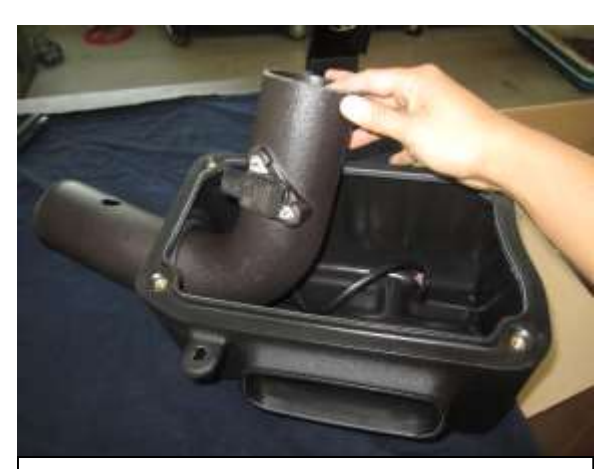
d. Slide intake tube thru the rubber lined outlet from inside of airbox as shown.