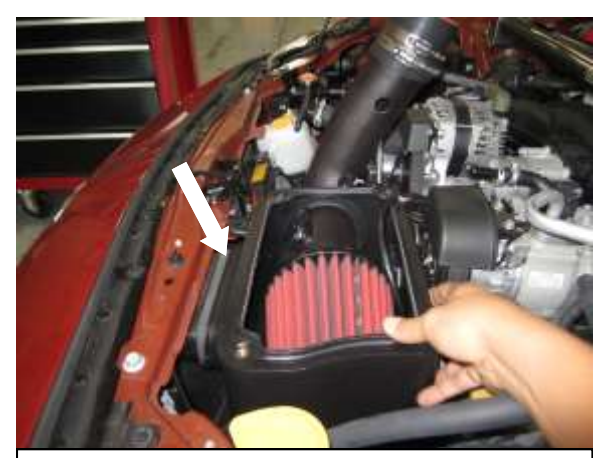
g. With intake tube pointing up, carefully install airbox, lining up stock inlet duct within AEM airbox inlet provision.