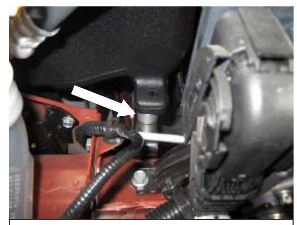
h. Slightly lift rear of airbox and insert spacer(O) between stock mounting stand and airbox mount feature.