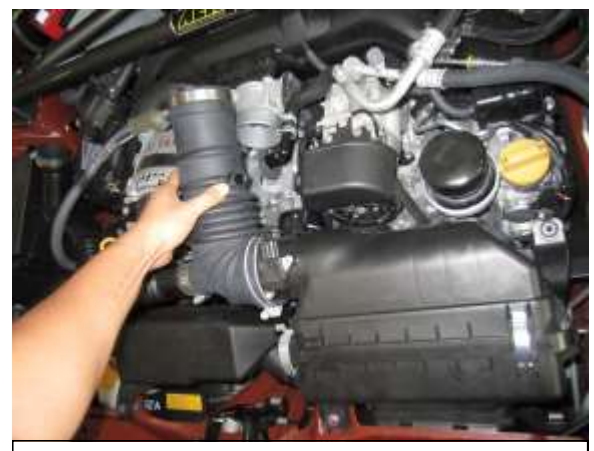
f. Slide rubber intake tube off throttle body and carefully remove intake box off inlet duct and set assembly aside.