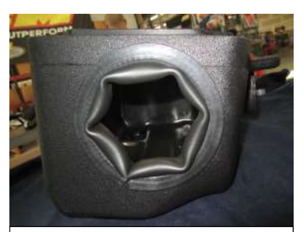
b. Install edge trim(I) along outlet hole of airbox(A) as shown. Trim to fit if necessary.