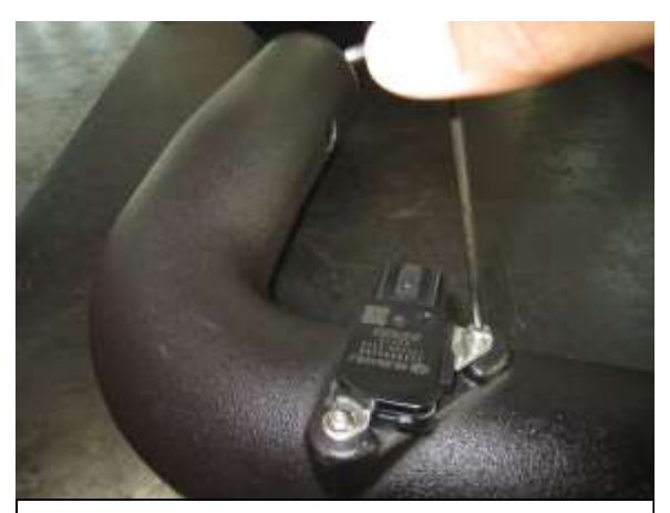
a. Install MAF sensor into intake tube(B) and secure with M4 button screws provided(K).

a. When installing the intake system, do not completely tighten the hose clamps or mounting hardware until instructed to do so.