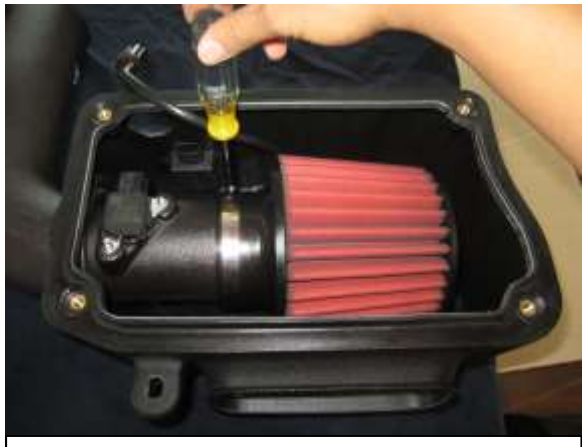
e. Place air filter element(D) inside airbox with hose clamp(J) and slide onto intake tube. Ensure tube is fully seated within filter base and fasten hose clamp.