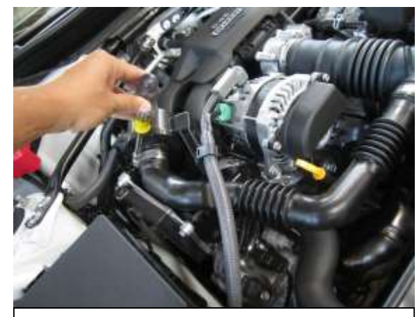
b. Loosen hose clamps on intake sound creator and throttle body. Disconnect plastic tube from sound creator.