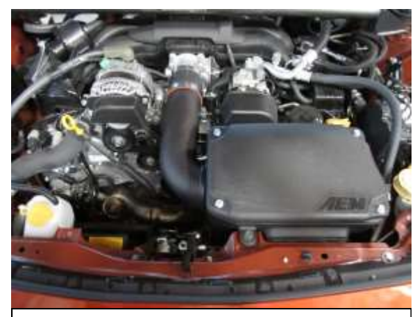
p. AEM intake installed.