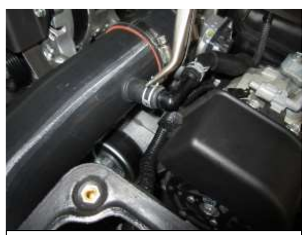
m. Install PCV adapter(H) onto intake tube hole located near AEM logo. Insert plastic elbow into adapter and fasten using stock spring clamp.