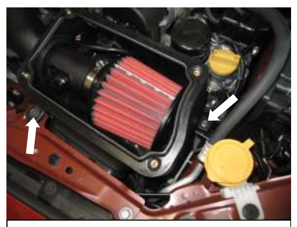
i. Fasten upper airbox mount with stock bolt removed in step 5 of removal instructions and use hex flange bolt(P) to secure lower right airbox mount.