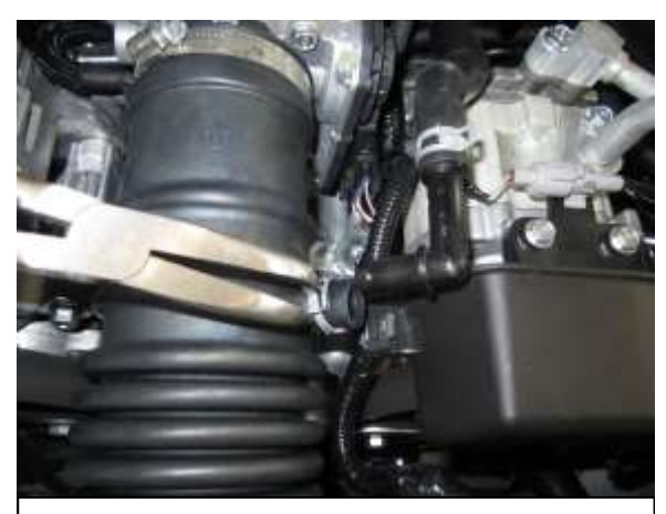
c. Compress spring clamp on rubber intake tube nipple and disconnect plastic elbow from tube. Set spring clamp aside for later use with AEM tube.