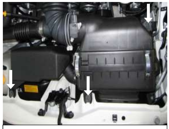
e. Remove the three M6 bolts indicated using a 10mm socket.