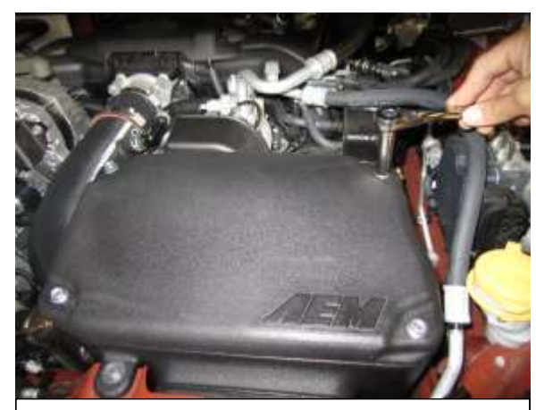
n. Line lid(C) up with airbox and fasten down with hex flange bolts(N) provided.