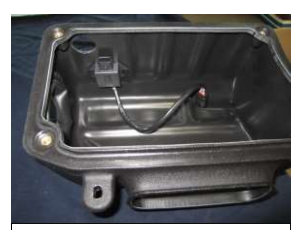
c. Use plastic tree mount clips(G) to secure ETI module(L) along inside of box making sure male end is pointed upwards as shown.