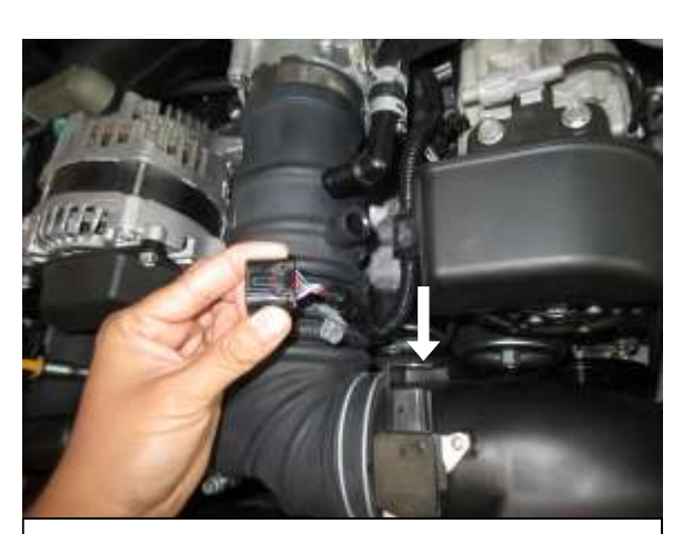
d. Disconnect MAF plug from sensor. Detach gray plastic clip on MAF harness from rear intake box as shown.