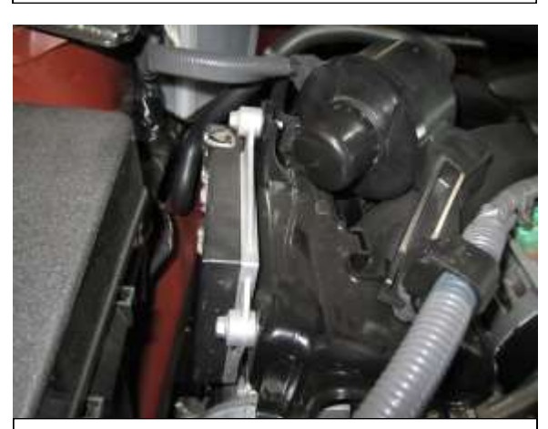
o. Install supplied vinyl cap(Q) over inlet of sound creator.