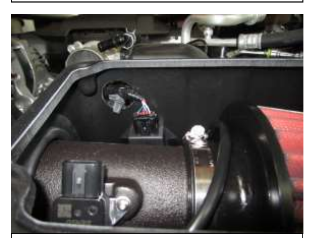
j. Insert MAF connector through rear hole of airbox and connect to ETI module.