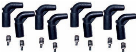
Part No. 46067**

Note: Taylor's exclusive PROBOOTS® are not sold separately - see Spark Plug Repair Kits.