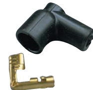
Part No. 46056**