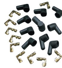
Part No. 46057**