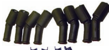
Part No. 46069**