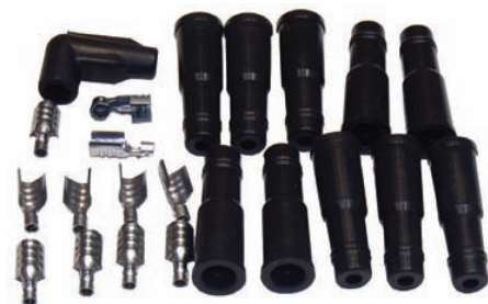
Part No. 46052**