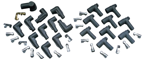
Part No. 46051**