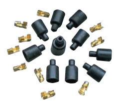
Part No. 46059**