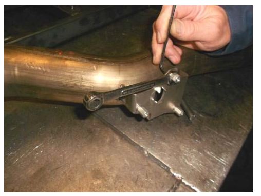
2) Then mount with the spacers and washers attached. Tighten securely.