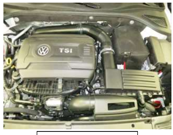
f. Factory air induction system.

e. Torque all four hose clamps to 30 in-lbs.