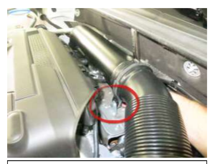
d. Remove the bolt behind the engine securing the factory intake hose to the engine.

b. Disengage the spring clamp retaining the coupler on the turbo inlet.