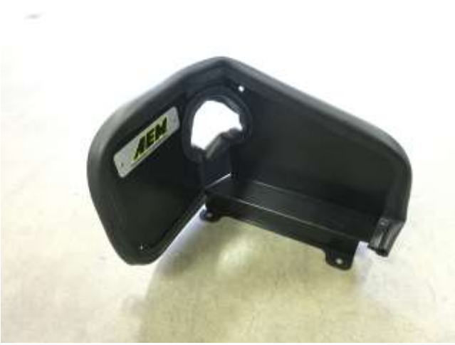
c. Install the two pieces of edge trim onto the heat shield. Note: Some trimming may be necessary.