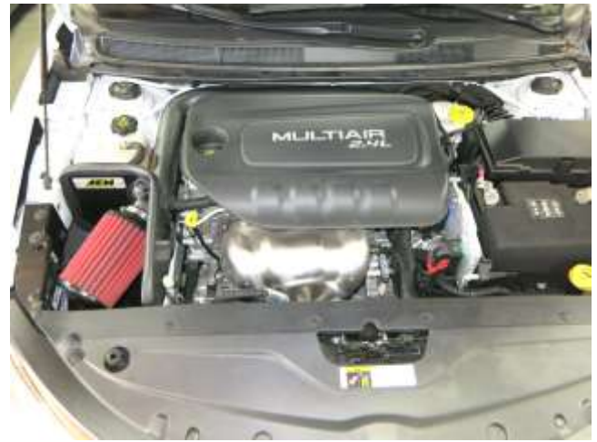
AEM INTAKE INSTALLED