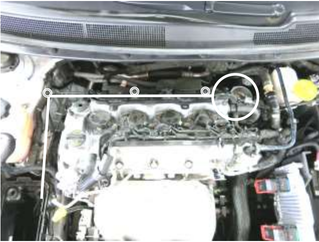
a. Install the extension harness onto the vehicle. Plug one end into the factory connector circled and zip tie the harness to the vehicle where shown.

a. When installing the intake system, do not completely tighten the hose clamps or mounting hardware until instructed to do so.