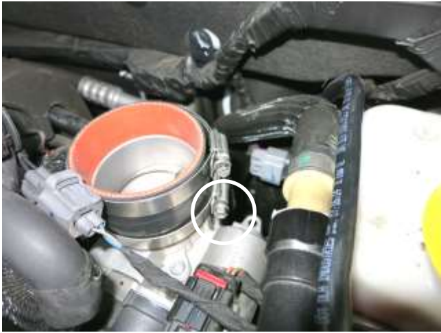
b. Install the coupler with the two supplied (9444) hose clamps and tighten the one closest to the throttle body.