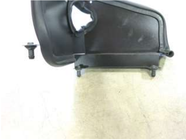
d. Install the bolts and air box mounts to the heat shield as shown.