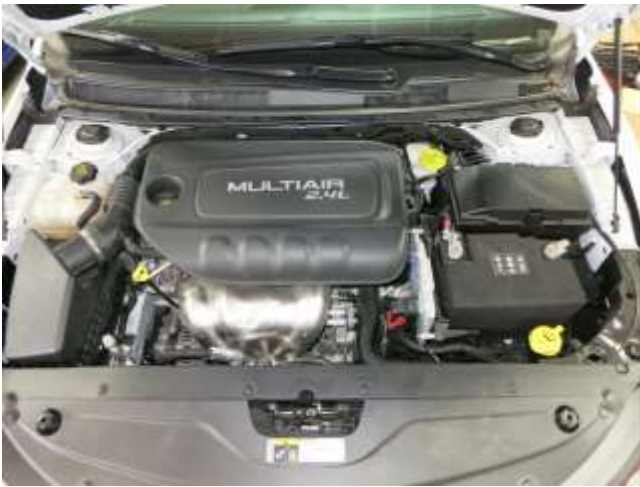
STOCK INTAKE INSTALLED