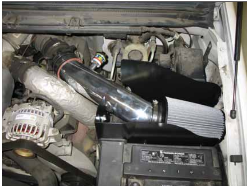
AEM® intake system installed

I. Double check the alignment of the intake pipe, air filter, and heat shield to ensure proper fitment and clearance. Once proper fitment has been achieved, tighten the hose clamps on both the coupler and the air filter. Install the supplied edge trim onto the top edges of the heat shield. Trim excess if necessary.