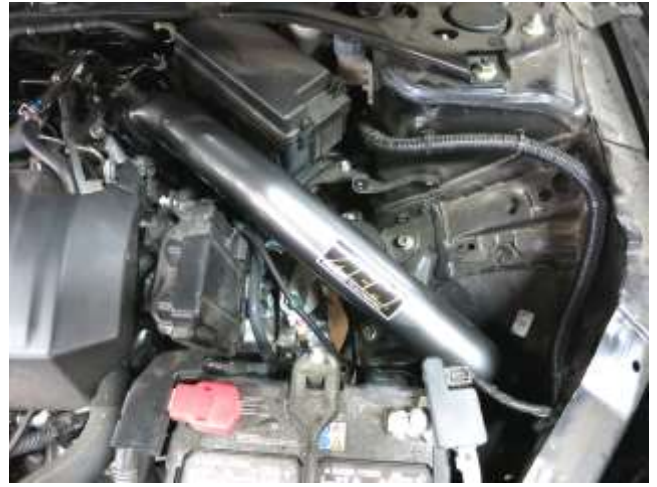
i. Finished installation of AEM Intake System.