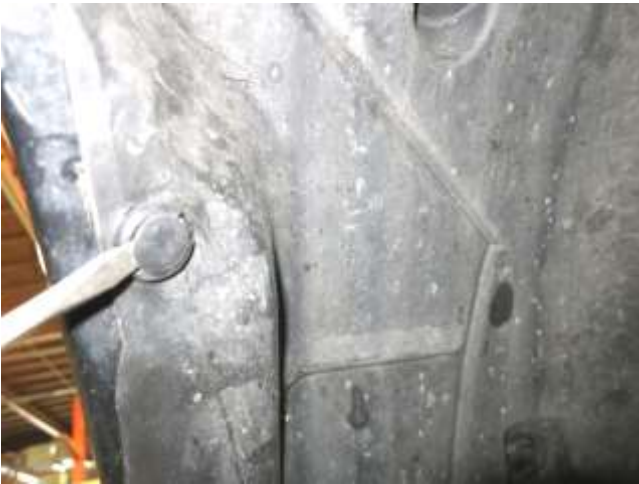
er on both sides, one after the other and twisting until one piece separates from the other. Both pieces of the