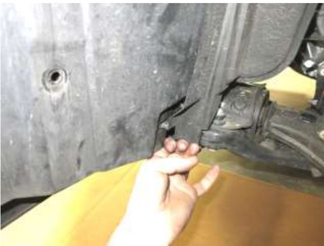
g. Separate the undercarriage panel from the fender liner by rotating them away from each other.