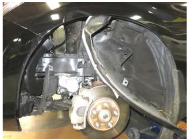
h. Once the fender liner is free, it can fold neatly back behind the brake assembly as shown.