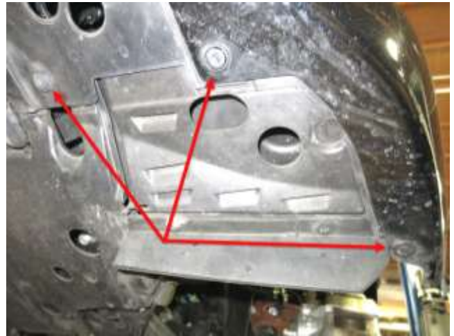
clip can then be pulled out together. Repeat for the three clips in front of the wheel shown above.