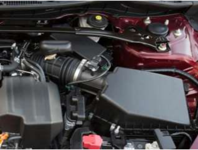
h. Factory air induction system.