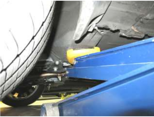
e. Jack vehicle up at a weight bearing location to lift driver-side wheel off the ground, then remove the wheel.