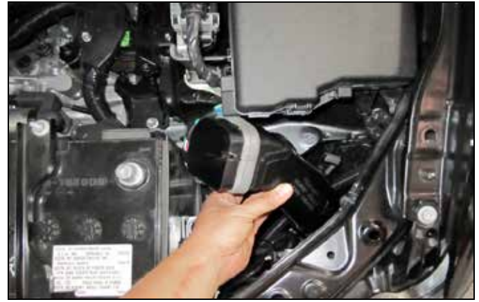
l. Slide the inlet tube down towards the headlight slightly and remove the inlet tube from the vehicle.