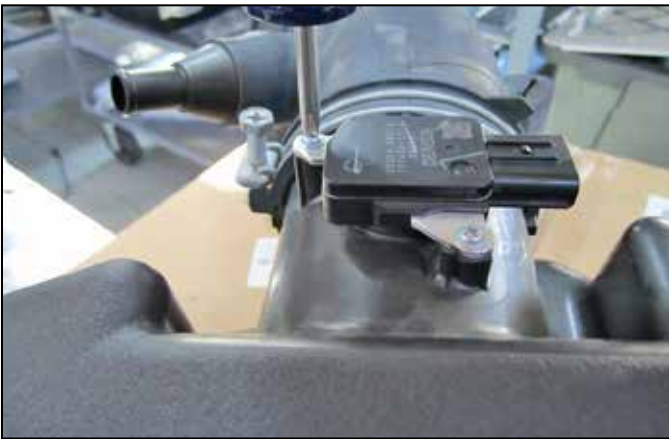
m. Remove the MAF sensor using a Phillips head screwdriver and set aside for later use during the AEM® intake installation.