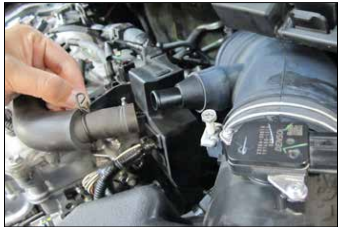
d. Pinch and slide back the black spring clamp on the valve cover hose. Twist valve cover hose to disconnect from intake tube.