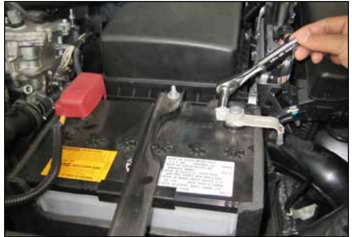
b. Disconnect negative terminal on battery using 10mm socket and tuck away from battery.