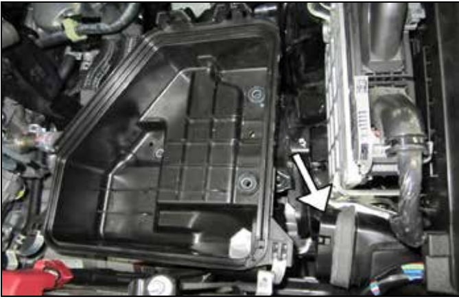
k. Disconnect lower airbox from inlet tube. Remove the lower airbox and set aside.