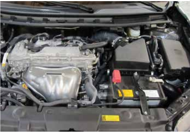
a. Stock airbox system installed.