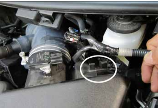
c. Disconnect wire harness from MAF sensor and unclip MAF wire harness from stock airbox.