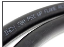
CAST relocation kits include 30" high-temp/pressure Oil Lines