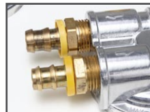
CAST relocation kits include solid brass barbed fittings