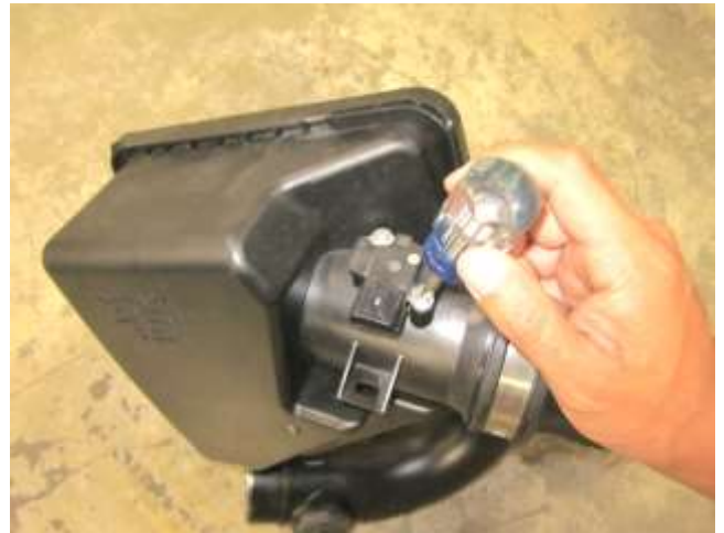
h. Remove MAF sensor from stock air box and set aside for installation on AEM intake tube.