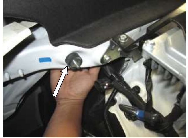
b. Install the supplied rubber mount(07027) onto the fender frame and fasten from behind using the supplied washer(08160) and nut(444.460.04).