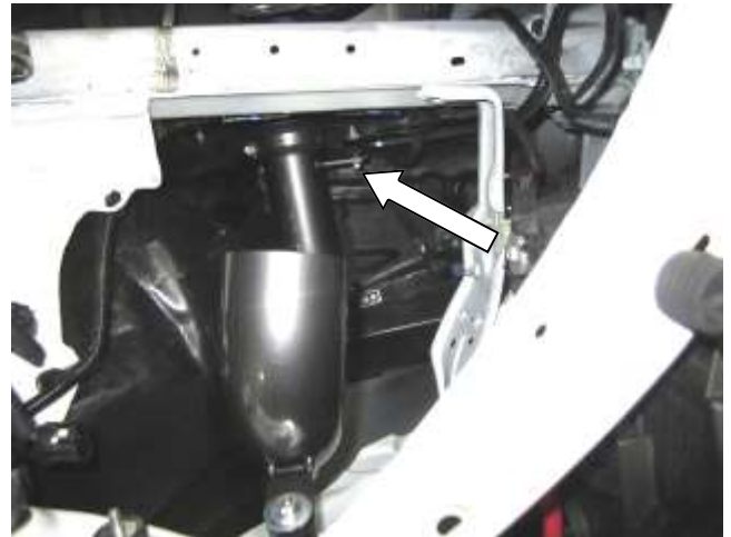
d. Install the AEM tube into the stock lower bellow coupler. Align the lower bracket to the stock rubber mount and fasten with the original nut from step 2f. Fasten upper bracket to the rubber mount installed in step 3c using the washer(08160) and nut(444.460.04) provided. Check for clearance around tube and fasten the stock hose clamp to secure the bellow coupler to the tube.