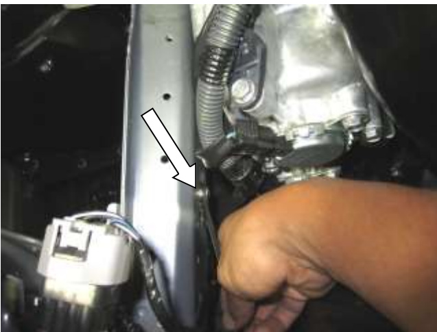
i. Remove the M6 ground bolt located on the lower frame rail and set aside for use with AEM heat shield.