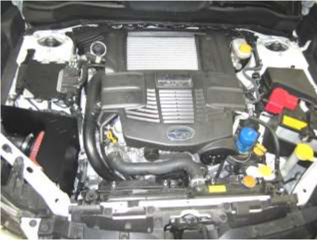
k. AEM intake system installed.