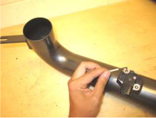
a. Install the mass air flow sensor that was removed in 2h) into the AEM intake tube with the supplied hardware (1-2051) using 4MM Hex Key.