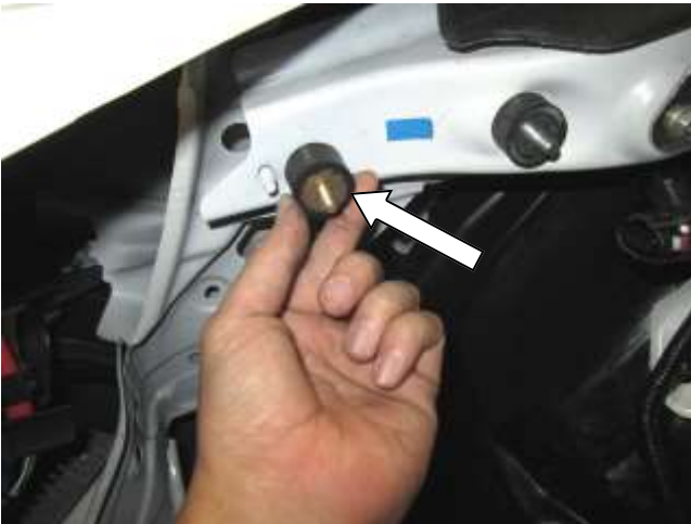
c. Install the rubber mount(1228596) onto the location shown.