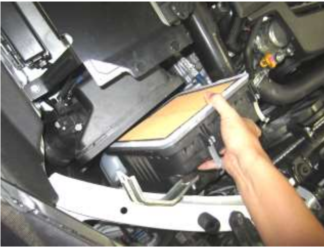
e. Unlatch and carefully remove the stock air box lid and filter from the engine bay.