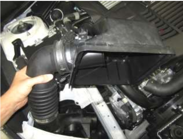
g. Slide the intake tube off the lower bellow coupler and remove tube/box assembly from engine bay.