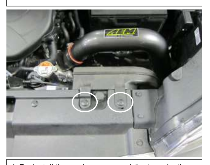
j. Re-install the engine cover and the two plastic clips holding the stock scoop in place.