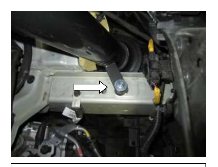
f. After the filter is installed, make sure tube alignment and filter clearance are good before tighten the two hose clamps at the throttle body. Then, tighten the nut securing the bracket to the rubber mount.