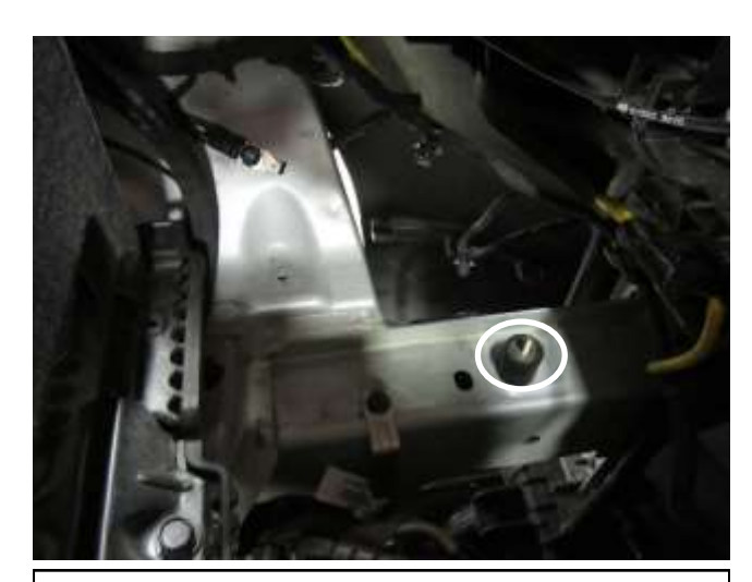
b. Install the rubber mount (1228599) onto the vehicle in the location shown.