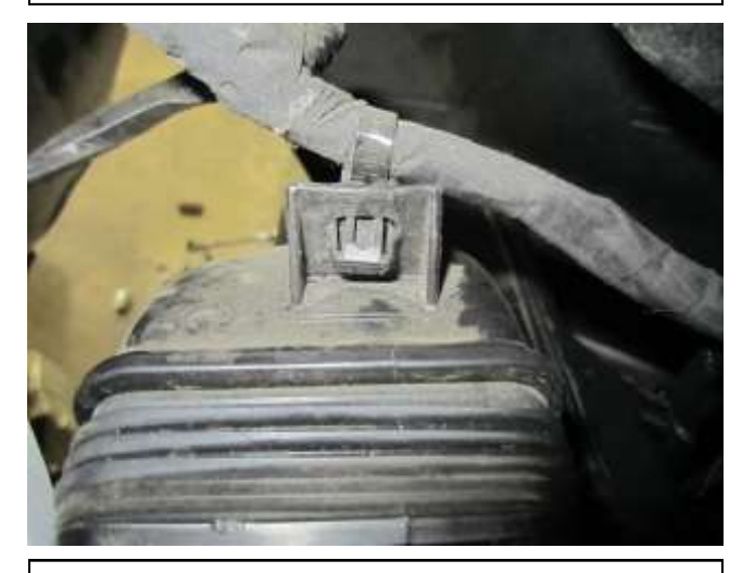
i. Squeeze the clips together while pulling away from the clip retainer. Remove the resonator from the vehicle.