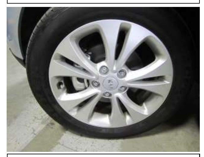
i. Re-install the drivers side wheel and torque lug nuts to manufacture specifications.