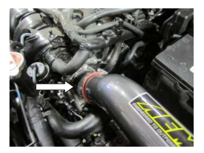
d. Install the AEM intake tube into the hose at the throttle body.