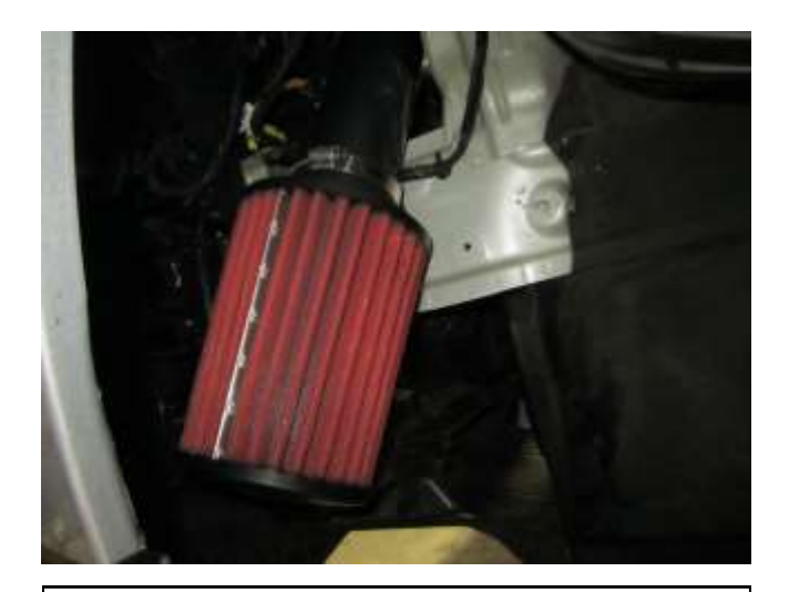
e. Install the AEM filter (21-2027DK) and hose clamp (9448) onto the AEM intake tube through the wheel well and tighten the hose clamp at this time.