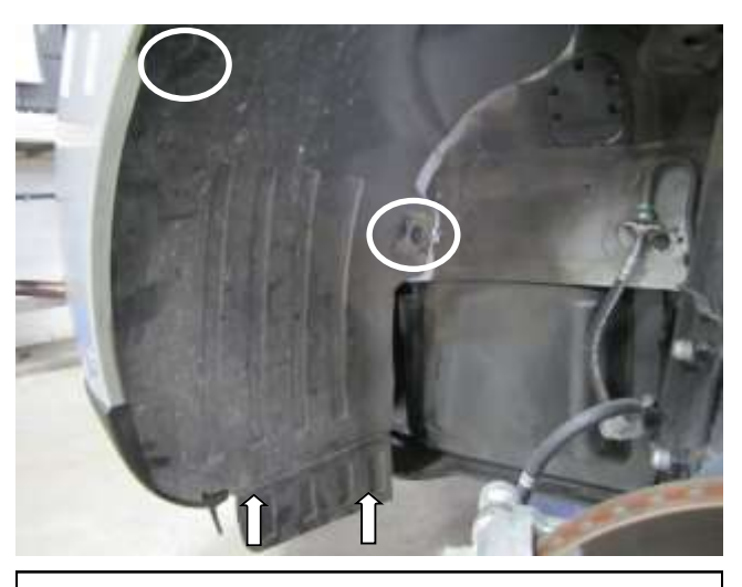
f. Remove the four plastic clips securing the inner wheel well liner. Two of the plastic clips are on the bottom of the liner.