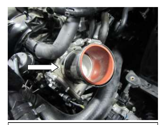
a. Install the supplied hose (5-277) and hose clamps (9444) onto the throttle body. The hose is angled, so make sure that the hose is angled up.

a. When installing the intake system, do not completely tighten the hose clamps or mounting hardware until instructed to do so.