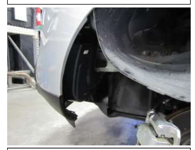
h. Remove the three bolts that secure the resonator to the vehicle. *See step g for location of the bolts.