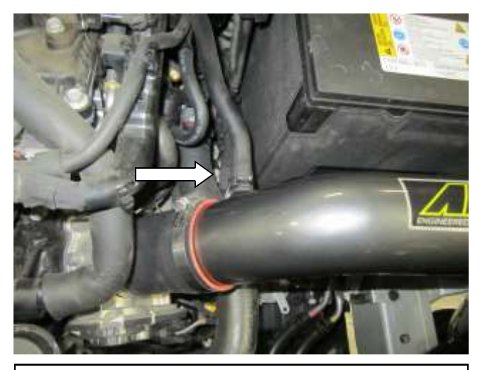
g. Connect the engine breather hose onto the AEM intake tube and secure with the pressure clamp that was removed in step 2b.