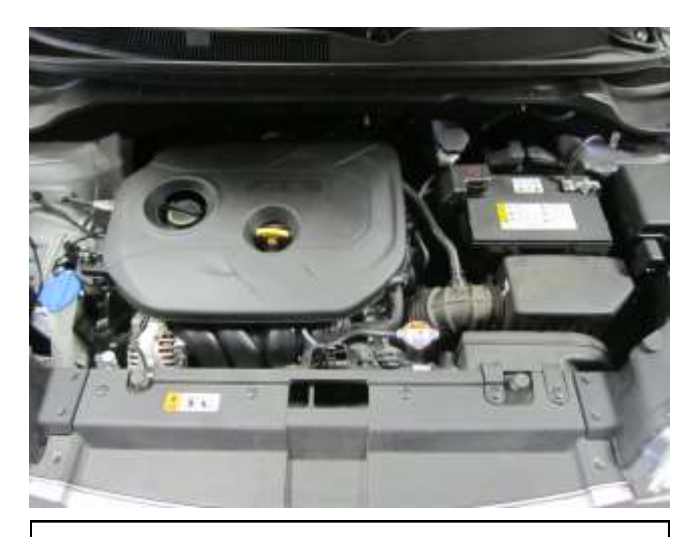
STOCK INTAKE INSTALLED