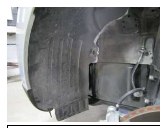
h. Re-install the four plastic clips securing the inner wheel well liner that were remove in step 2f.