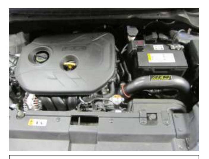
AEM INTAKE INSTALLED