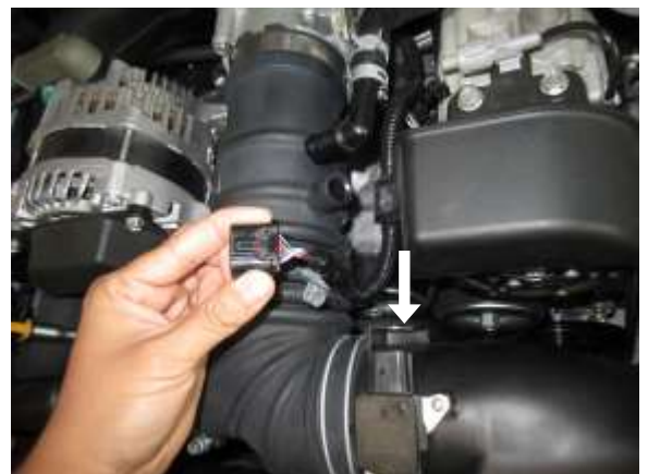
d. Disconnect MAF plug from sensor. Detach gray plastic clip on MAF harness from rear intake box as shown.