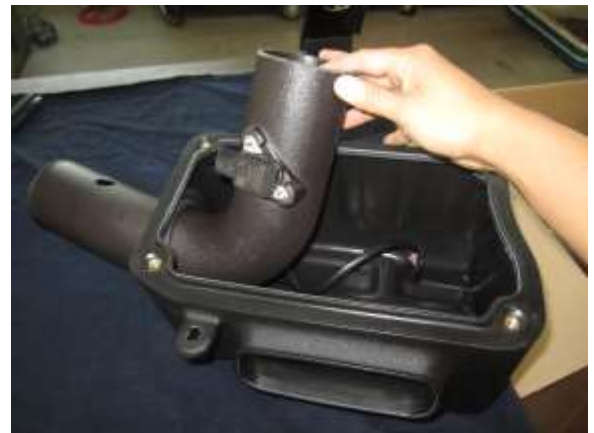
d. Slide intake tube thru the rubber lined outlet from inside of airbox as shown.