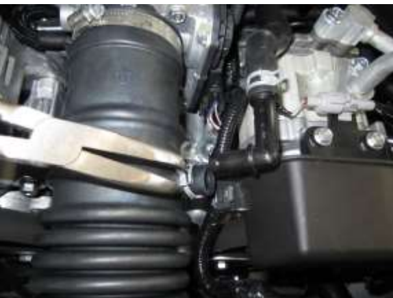
c. Compress spring clamp on rubber intake tube nipple and disconnect plastic elbow from tube. Set spring clamp aside for later use with AEM tube.