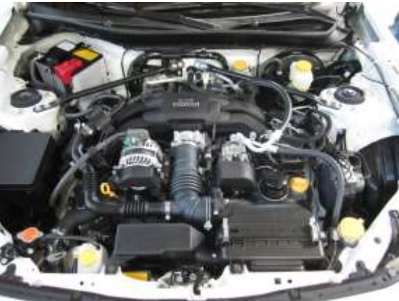
a. Stock intake system