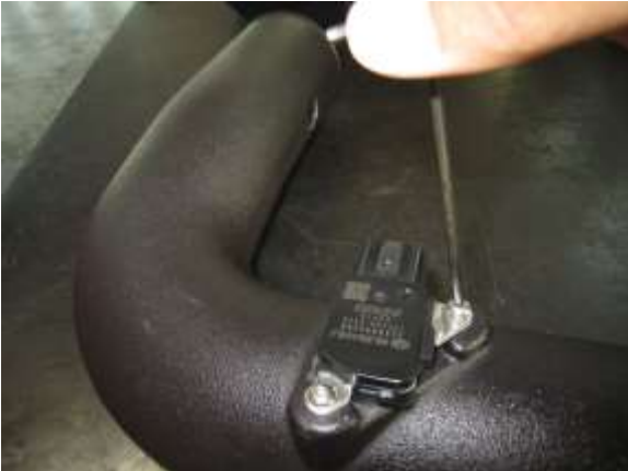
a. Install MAF sensor into intake tube(B) and secure with M4 button screws provided(K).