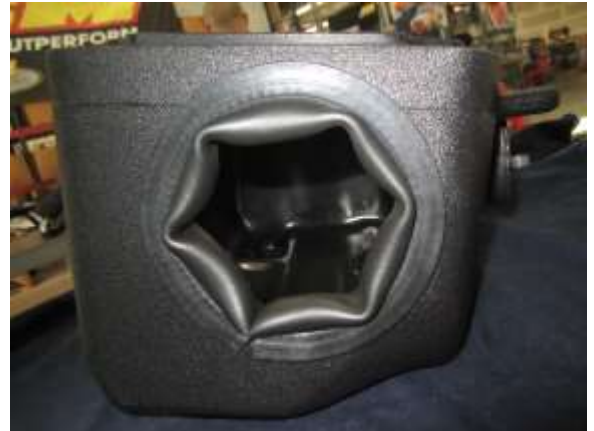
b. Install edge trim(I) along outlet hole of airbox(A) as shown. Trim to fit if necessary.