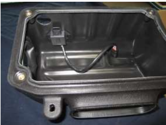
c. Use plastic tree mount clips(G) to secure ETI module(L) along inside of box making sure male end is pointed upwards as shown.