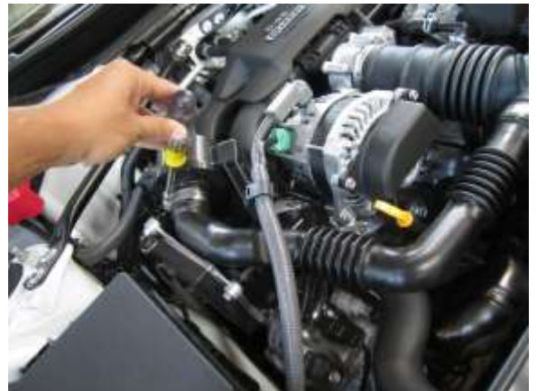
b. Loosen hose clamps on intake sound creator and throttle body. Disconnect plastic tube from sound creator.