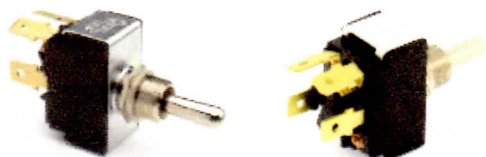
PP-55046 Momentary Toggle Switch

Special forward-reverse switch UP: Momentary On CENTER: Off DOWN: Momentary On Four 0.250" quick-connect blade terminals Standard length handle Silver Contacts Nickel-plated brass mounting stem, 15/32"-32 thread, 15/32" long (11.9 mm) Fits panels to 9/32" (7.1 mm) Phenolic housing with plated steel cap Nickel-plated brass hardware 25A @ 12V, 15A @ 24V, 10A @ 36V DC