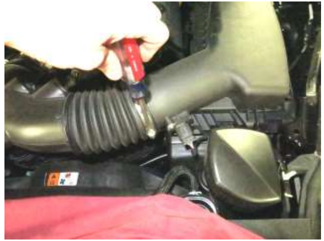
f. Loosen the clamp retaining the factory intake duct to the airbox and remove the duct.