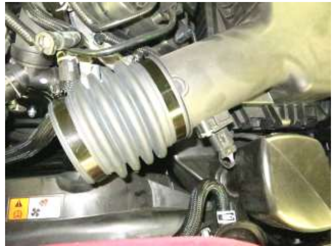
b. Install the bellows coupler and clamps on the airbox.