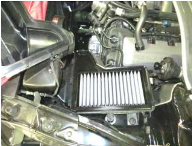
a. Disengage the clips securing the airbox lid and lift to replace the air filter. Reinstall the lid.

a. When installing the intake system, do not completely tighten the hose clamps or mounting hardware until instructed to do so.