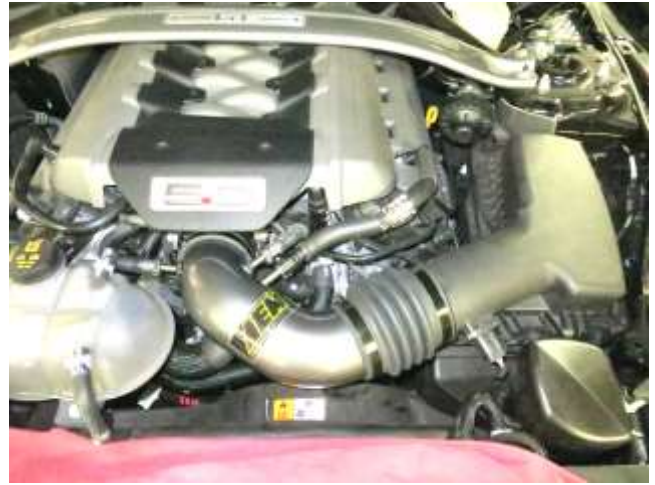
f. Finished installation of AEM Intake System.