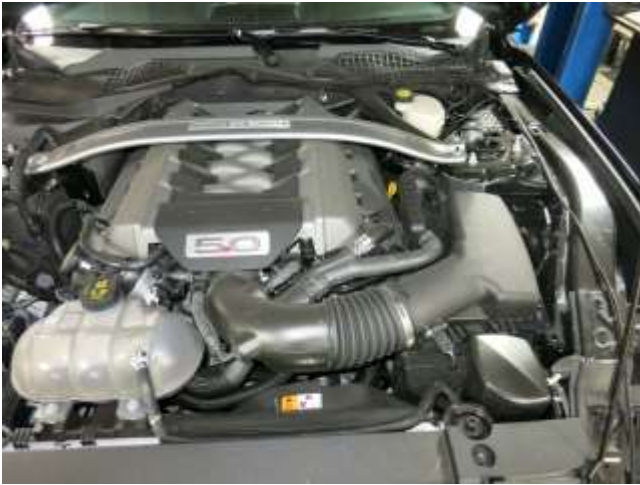
e. Factory air induction system.