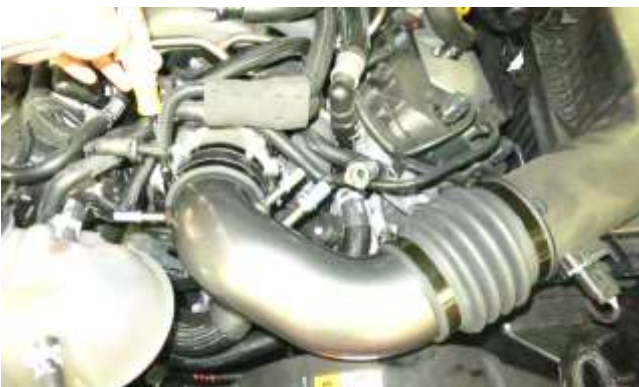
c. Install the intake tube with the coupler and clamps to the throttle body. Torque all clamps to 30 in-lbs.