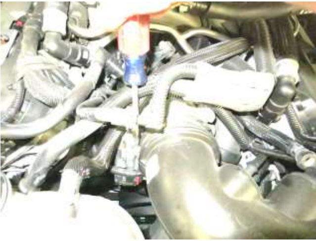
e. Loosen the hose clamp retaining the factory intake duct to the throttle body.