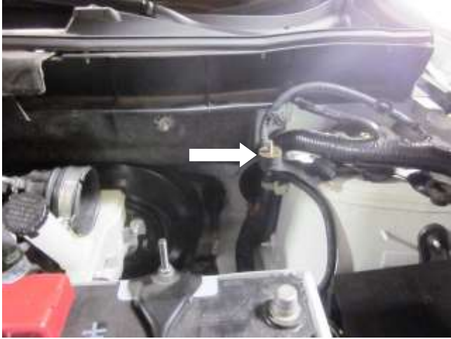
b. Install one of the provided rubber bushings in the bracket where you removed the M6 bolt in step "C" and tighten.