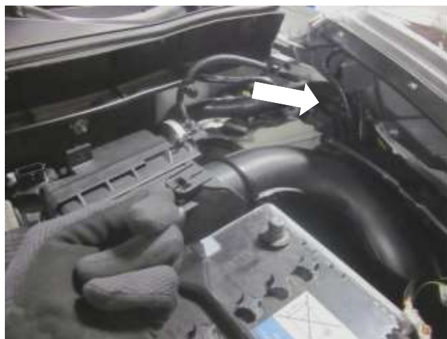
b. Lift up on the air box tab and pull out the locating pin on the stock air intake tube.