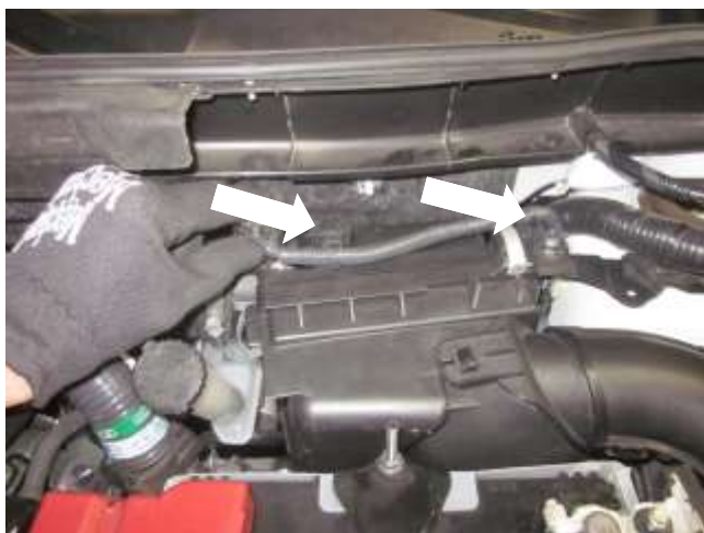
a. Unplug the MAF sensor connector and disconnect the two clips holding the wiring harness to the airbox.