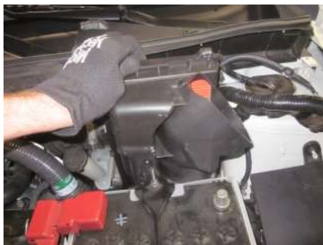
d. Remove the front half of the air box with the filter intact by lifting out of the vehicle.