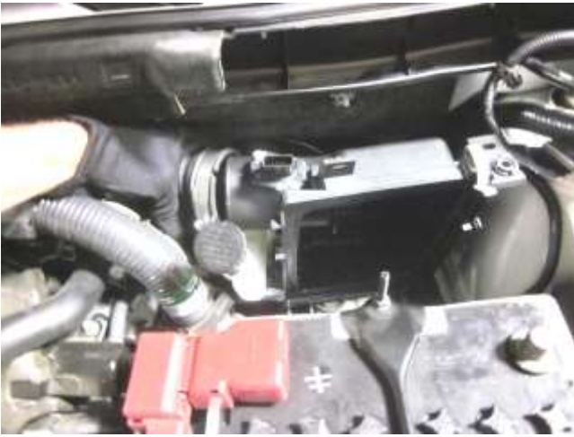
e. Disconnect the stock intake tube from the stock air box.