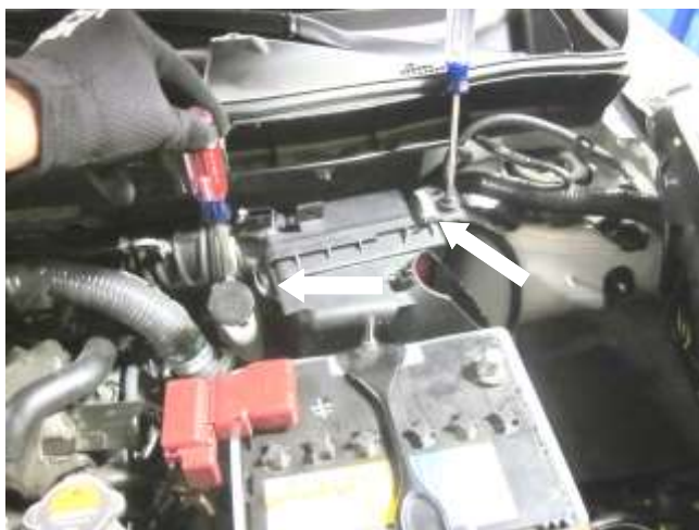
c. Loosen the hose clamp, remove the M6 bolt, and disconnect the two latches securing the air box together.