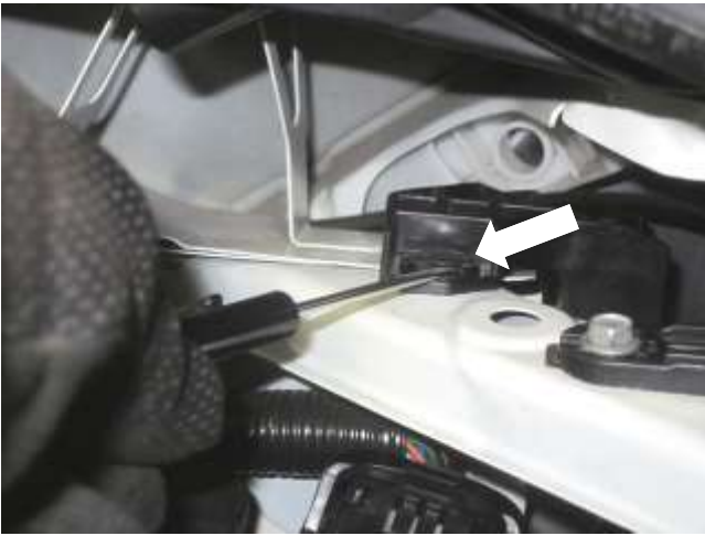
g. Disengage the resonators plastic locating tab above the drivers side head light.