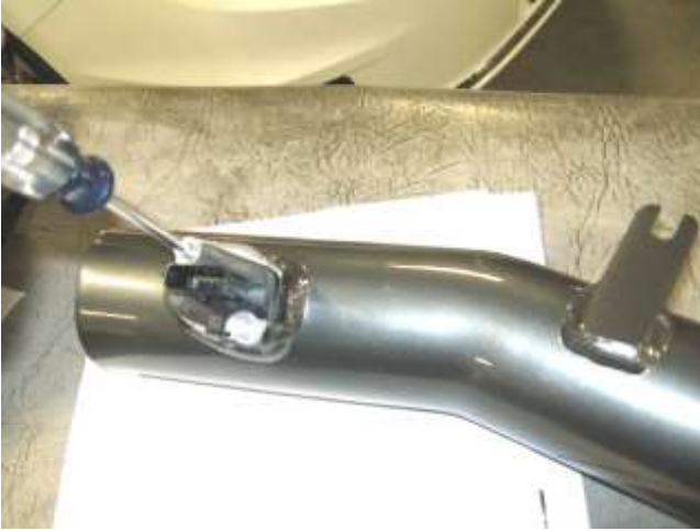
a. Install the MAF sensor and two M2 screws that were removed in 2j and tighten into the AEM intake tube.

a. When installing the intake system, do not completely tighten the hose clamps or mounting hardware until instructed to do so.