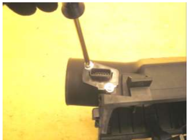
j. Remove the two M4 Screws and pull out the MAF sensor. Note: Handle with care. The sensor and screws will be reused in step 3a.