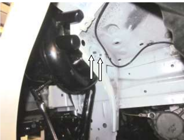
i. Remove the two M6 bolts in the fender well brace that hold resonator and harness bracket in place.