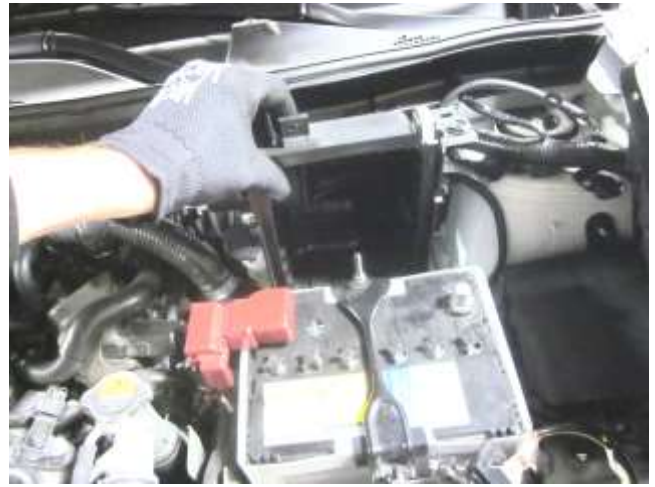
f. Remove the stock air box from the vehicle. Note: Remove the rubber bushing pins underneath the stock air box and reinstall on the stock air box locating