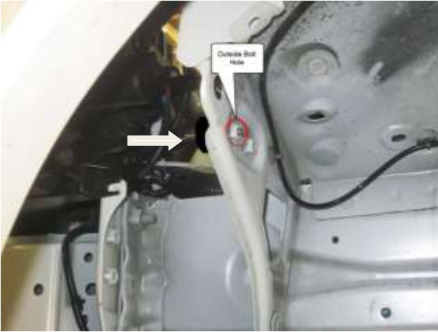
c. Install the second rubber bushings into the "outside" bolt hole in the fender well brace, making sure to capture the harness bracket, and tighten.