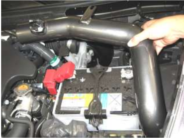
d. Install the AEM intake tube by inserting it into the opening next to the battery and into the lower fender well first, and then gently maneuver it into position.