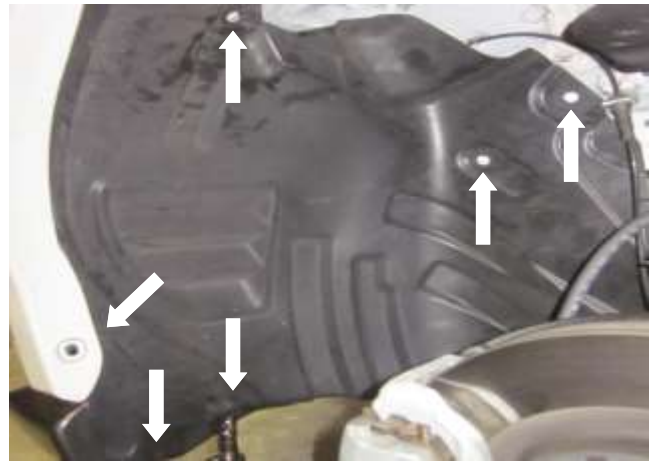
h. Raise vehicle to remove left front wheel. Remove the four locating tabs and the two M6 bolts that hold the wheel well liner in place. Position the liner out of way.